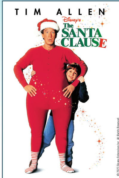
The Santa Clause