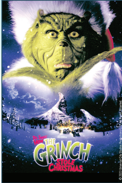
Dr. Seuss' How the Grinch Stole Christmas