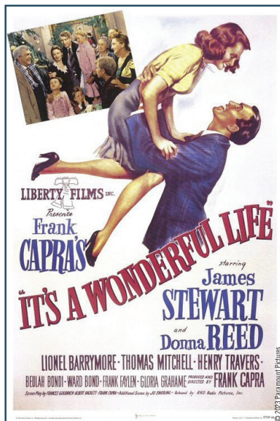
It's a Wonderful Life

Play Bingo-Ho-Ho during the screening. Include squares like “an elf appears” or “someone’s given a present” that students mark off once they occur on-screen. When someone has a bingo, have them ring a small bell so it’s less disruptive to those enjoying the film.