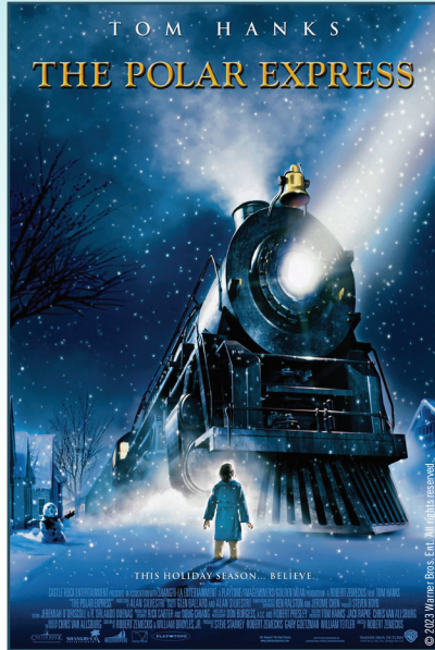
The Polar Express