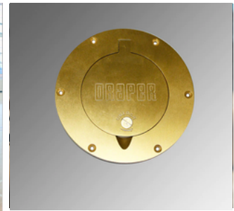
COVER PLATES + PARTS, MORE