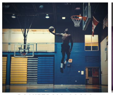
BASKETBALL GOALS + BACKBOARDS, RIMS, MORE