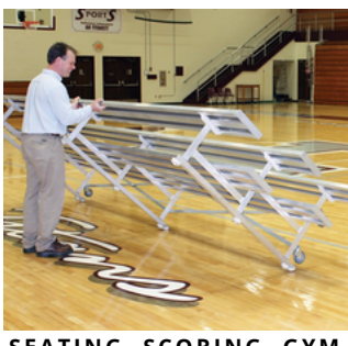
SEATING, SCORING, GYM + OTHER GYM EQUIPMENT