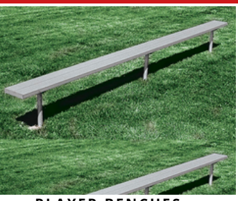
PLAYER BENCHES + SEATING