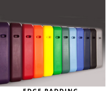
EDGE PADDING + WALL PADDING, MORE