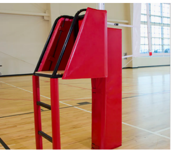
JUDGES STAND + CARTS, PADS, MORE