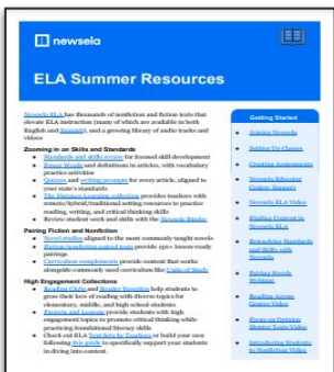
Click HERE for ELA Resources